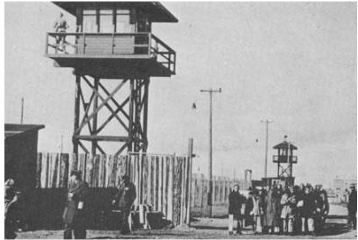
Prisoners from the Tule Lake concentration camp stockade overseen by soldiers in guard towers. Tule Lake became a segregation center in 1943 for those who resisted the mistreatment.

RECOMMENDATION: Instead of relocation center , the words American concentration camp is recommended. Depending on the context, words with quotation marks “ American concentration camp ” may be used. Alternatives are incarceration camp or illegal detention center . Ten types of U.S. imprisonment centers during WWII have been described (Kashima, 2003, p.11).