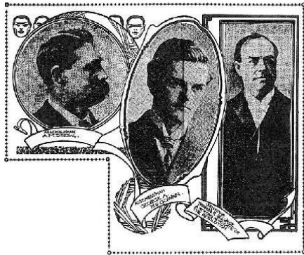
Headline from the San Francisco Chronicle on March 3, 1905.