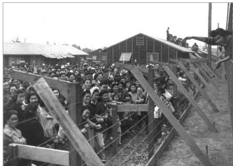
Japanese Americans behind the barbed wire fence in Santa Anita Race Track, a temporary detention center, waving goodbye to friends leaving by train for other incarceration camps.

We now focus in more detail on a list of words, which over time have elicited concerns of accuracy and authenticity to the events, actions, or reality on which they were applied—or not. While the published record cannot be changed, current and future analyses and assessments of historical facts will be better served for accuracy by using the recommended word or phrase, or explaining why not. In some cases, citing the word placed in quotation marks may be appropriate.