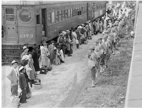
Japanese Americans from San Pedro, California, guarded by soldiers arrive at Santa Anita Race-track, a temporary detention center, in Arcadia, California, in 1942.

Definitions —a euphemism is “a mild word or expression substituted for one considered blunt and embarrassing” (Chantrell, 2002, p.186). It comes from the Greek euphemismos , from euphemizein ‘use auspicious words.’ The formative elements are eu “well” and pheme “speaking” (English usage since late 16th century) (Chantrell, 2002). In more modern times, author William Safire (1981) writes: “To some degree, euphemism is a strategic misrepresentation” (p. 82).